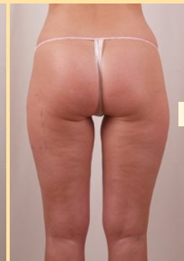
after 4 Tx