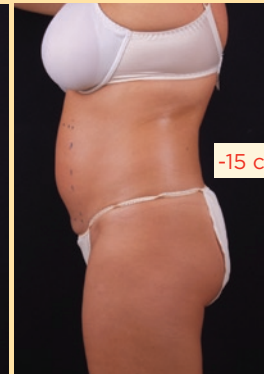
after 4 Tx